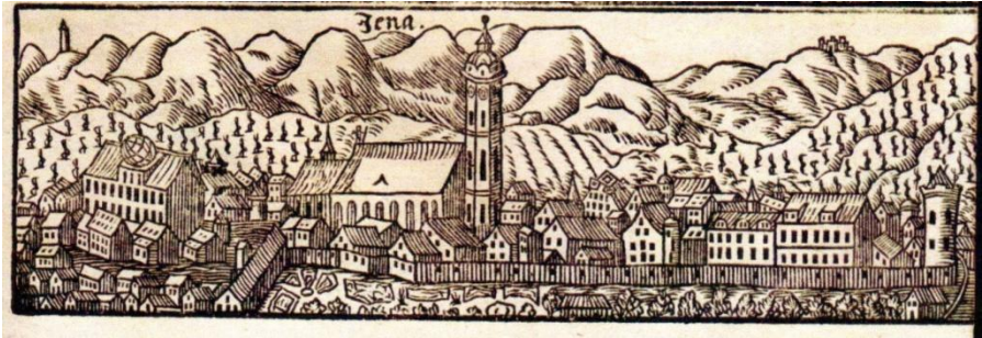
Jena with the castle (on the left edge of the picture) and the large celestial sphere on the castle roof (from Theophil Sternfreund: Geschichts=Calender für 1692 )