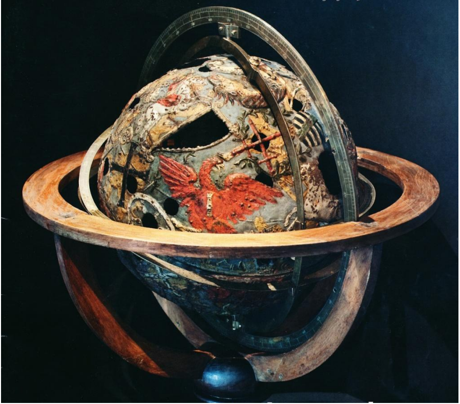
Heraldic celestial globe by Erhard Weigel (Trondheim, NTNU Vitenskapsmuseet)

In addition to these small globes, Weigel invented the type of "planetarium". This is a sphere up to 6 metres in diameter into which you could walk and in whose iron shell holes were pierced and arranged in such a way that sunlight shone through during the day and the viewer inside could recognise constellations with the indicated stars up to the third magnitude. Weigel combined this celestial sphere with some technology inside, which depicted the earth with the various phenomena (volcanic eruption, lightning, thunder, rain, fog), and thus created a "Pancosmos". Weigel had such a celestial sphere erected on the roof of Jena Castle.